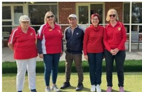
SACA Silver Medal competitors