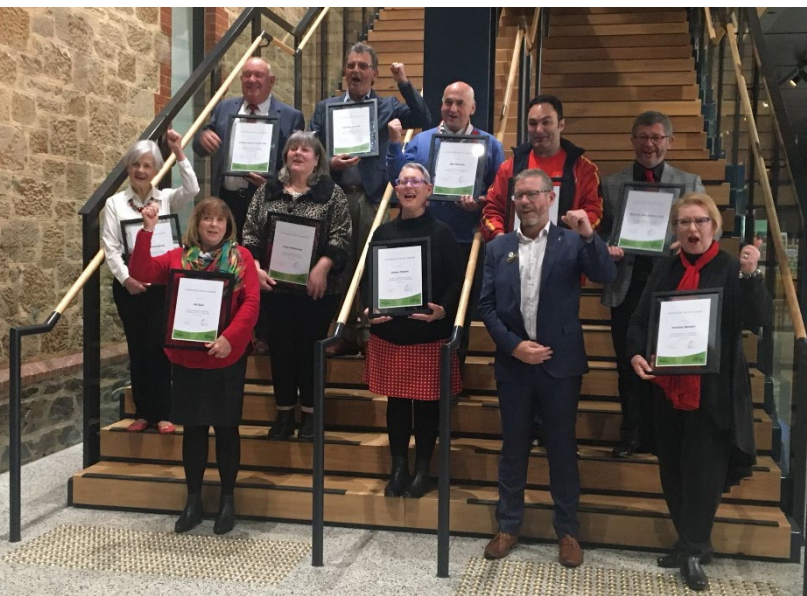
All 2021 recipients of Prospect Council Community Service Awards